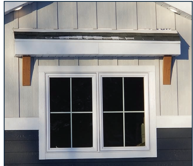
Shed roof with optional exterior wood features