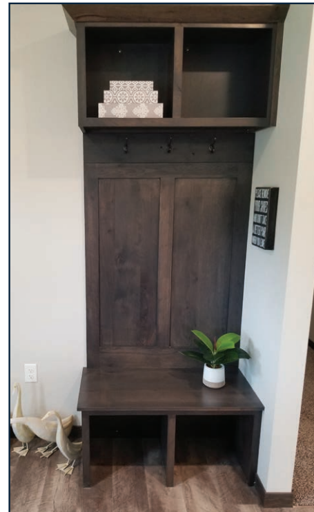
Optional Boot Bench